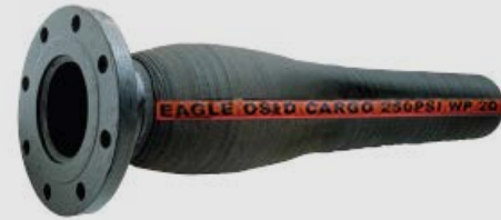
Eagle OS&D Cargo Hose