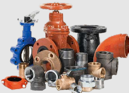
Valves, Elbows, Adapters