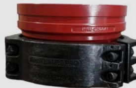
Produce Water Replacement Ends