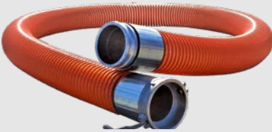
Eagle Orange/Clear Suction