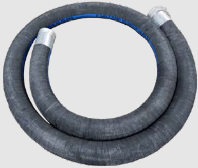
Eagle Pump 150# Rubber Suction