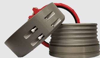
Field Replaceable Ends