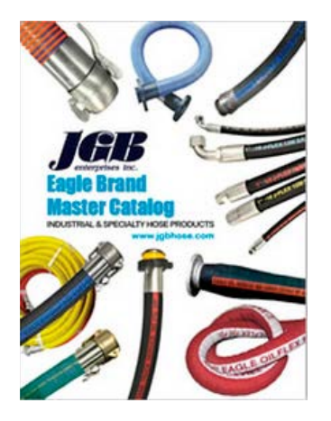
JGB Eagle Brand Catalog

For market specific catalogs visit www.jgbhose.com/hose-assemblies-fittings-by-market.