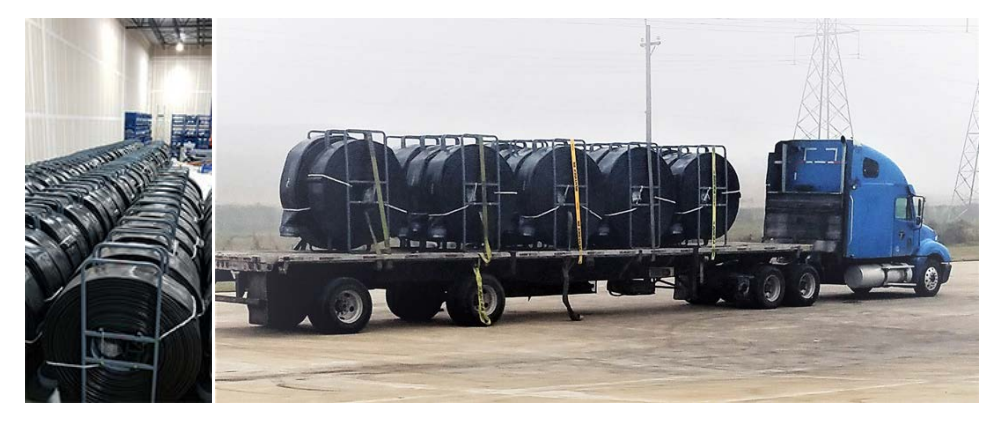
Racked and ready for shipment to our customer.