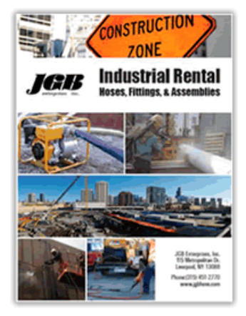
Industrial Rental Catalog