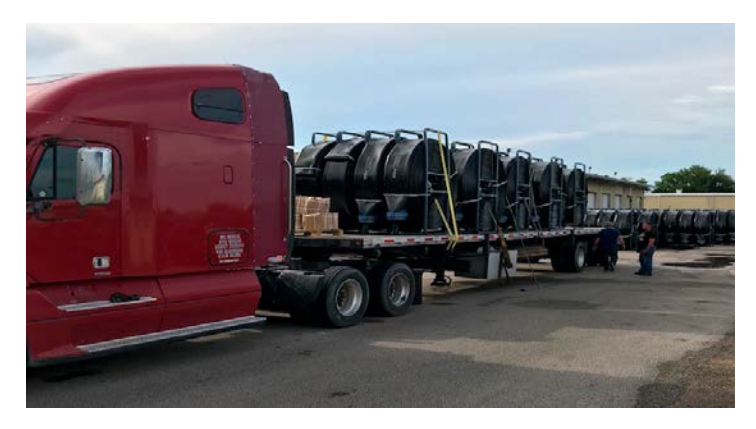
Eagle Water Transfer PU arriving at a JGB distribution center.

The LDH, or Large Diameter Hose market, is one of the fastest growing markets in our industry, specifically in the energy exploration sector. With the addition of the Techmaflex PES-500 Large Bore Hose Assembly Machine , we've expanded our production capabilities to meet the demand of these customers. JGB<sup>®</sup> Enterprises is a one stop shop for all of your custom LDH hose assemblies.